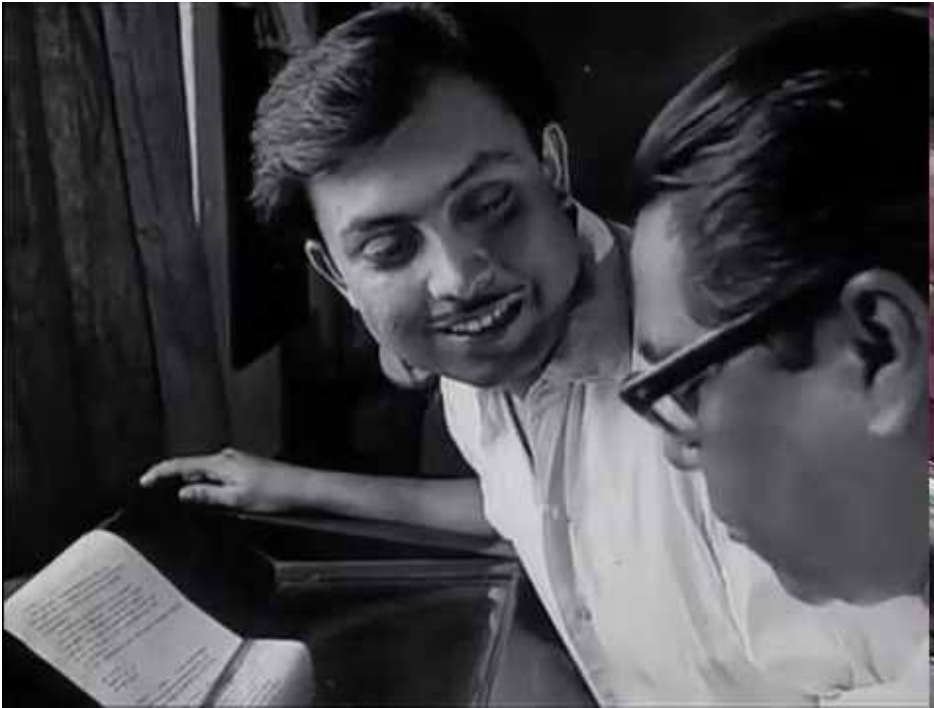
Ritwik Ghatak's Subarnrekha

Ritwik Ghatak's Subranarekha (1962) is a far cry from the world of Maya (illusion) and blind faith. It is rooted in the sufferings of daily life engendered by wholly avoidable political events. The protagonists are victims of the senseless partition of India in 1947. They have been uprooted from their native East Bengal and have come to a Suburb of Calcutta in Independent India.