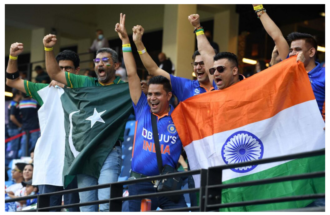
The MCG ground was sold out like all India-Pak matches the world over