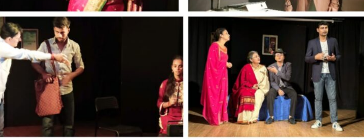
Natsamrat brought the Kumbh of plays for Mumbaikars i.e. 3rd Mumbai Theater Festival where five different plays were staged on May 26, 27 and 28 at Creative Adda Auditorium, Versova, Andheri West, Mumbai.