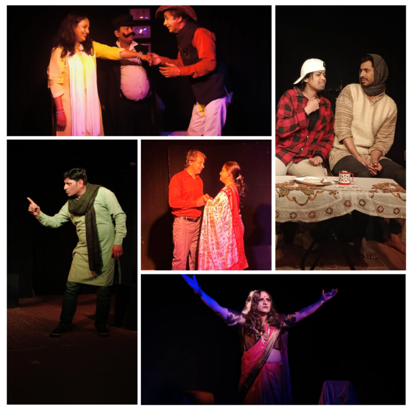
The "6th Mumbai Theatre Festival" organized by Natsamrat at the Creative Adda Auditorium in Versova, Mumbai staged many wonderful plays on 3rd, 11th & 12th January. These plays not only entertained the audience but also presented deep social and emotional issues effectively.