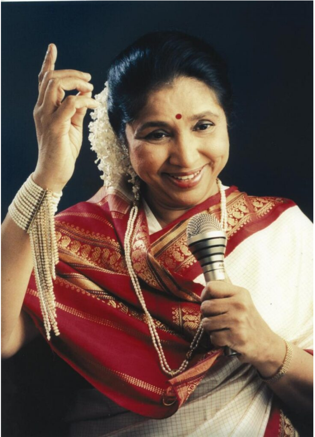
Evergreen Asha Bhosle when she was younger