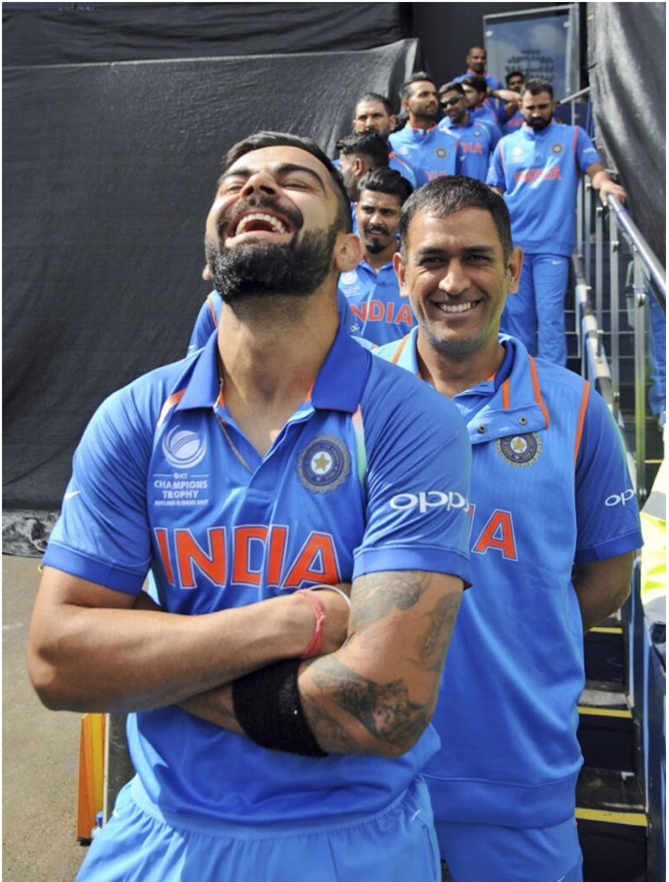
Rahul Dravid and MS Dhoni

With the induction of Roger Binny as new BCCI President, it is reported that his first call was to include MS Dhoni as Head Coach or Director, Team India T20. MS Dhoni is immensely