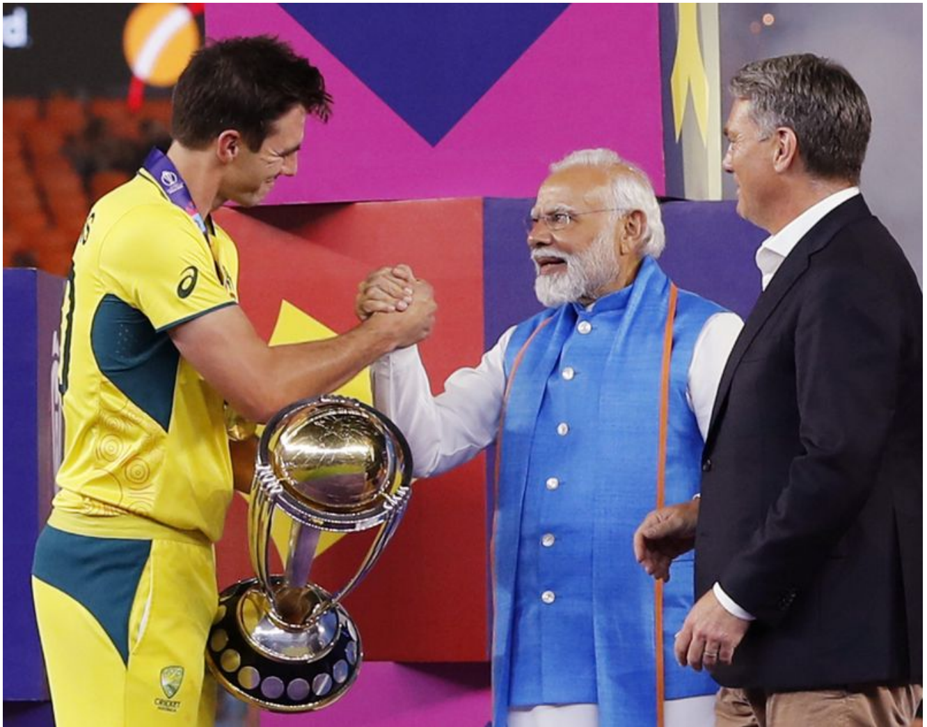
Indian PM Narendra Modi and Australian Deputy PM, Richard Marles Congratulate Australian Captain Pat Cummins

It is not digestible that India lost to Aussies in the CWC '23 finals while winning all 10 matches played on the trot. Even in the build up to the final, India beat Aussie comprehensively. But India's performance in the final is not worth taking note of. Number of blemishes on the part of India are the cause of concern.