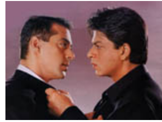
Above:- Shah Rukh Khan