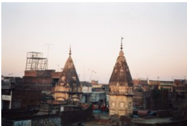
Above: Hindu Temples In Pakistan