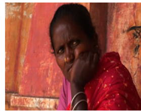
2. India 3. Goddesses

Makers of short or documentary films generally feel they are given the short shrift when they try to find finances for making their films, and are then treated to a step-son treatment by the government, the public service broadcaster Doordarshan, and the private television channels as far as distribution and exhibition goes. As a result, it is felt that people are no longer interested in short, documentary or animation films.