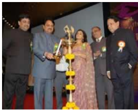
1. Maharashtra CM lighting the lamp Untouched