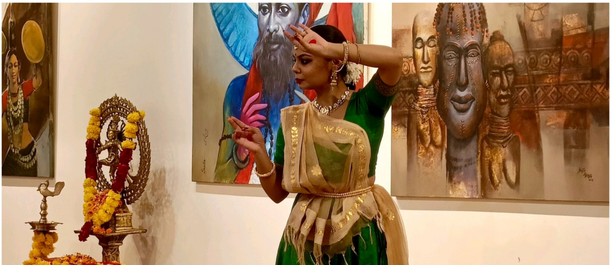
On the auspicious day of 10th July 2025, the Guru Purnima Celebration held at the Kala Sankul premises of Sanskar Bharati, New Delhi, transformed into a vibrant cultural