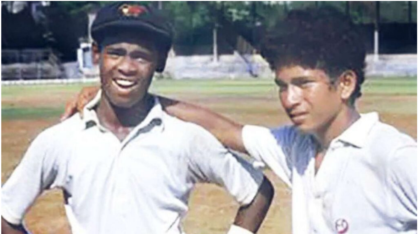
Kamli and Sachin childhood buddies

There is a thin line between success and failure. It is owing to the destiny that a person brings with him which makes him successful and unsuccessful. Let us take the case of Sachin and Kamli. Both together made a mammoth batting record during schooling. Sachin reached an iconic status, whereas, Kamli fell apart mid-way. Kamli could not do justice to his talent in life. He had to abandon his career mid-way because of his destiny. Does the formulae apply – as you sow, so shall you reap?