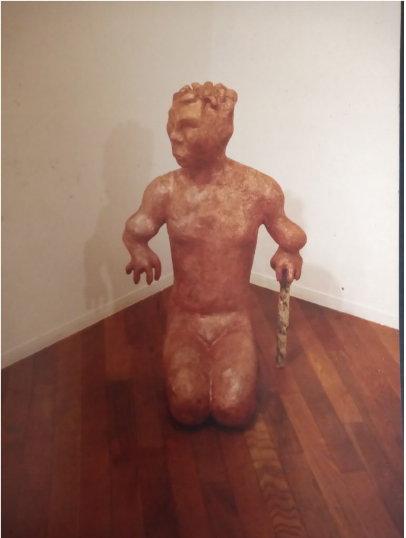
A seated man , homeless perhaps, his posture is almost that of a yogi. His torso is upright and handsome. He sits with his legs folded under in the yoga pose of Vajrasana , holding a stick in one hand for support. His arms are strong, although