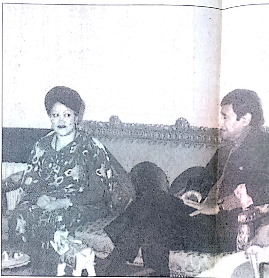
Representatives of cultural camaraderie: Dev Anand meets Queen Aishwarya (left); Shah Rukh Khan mobbed by female fans in Kathmandu

Inside, Dev held the audiences spellbound with his half-hour-long talk which was spiced with his experiences of the hill state, tales about the part King Birendra played in easing the way of Dev Anand's shootings in Nepal, the guitar-toting hippie girl who inspired the creation of a role for Zeenat Aman in Hare Rama Hare Krishna , and of course some personal advice on how to lead a dynamic life and remain young like himself.