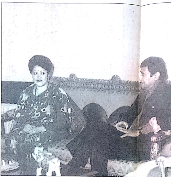
Representatives of cultural camaraderie: Dev Anand meets Queen Aishwarya (left); Shah Rukh

Inside, Dev held the audiences spellbound with his half-hour-long talk which was spiced with his experiences of the hill state, tales about the part King Birendra played in easing the way of Dev Anand's shootings in Nepal, the guitar-toting hippie girl who inspired the creation of a role for Zeenat Aman in Hare Rama Hare Krishna , and of course some personal advice on how to lead a dynamic life and remain young like himself.