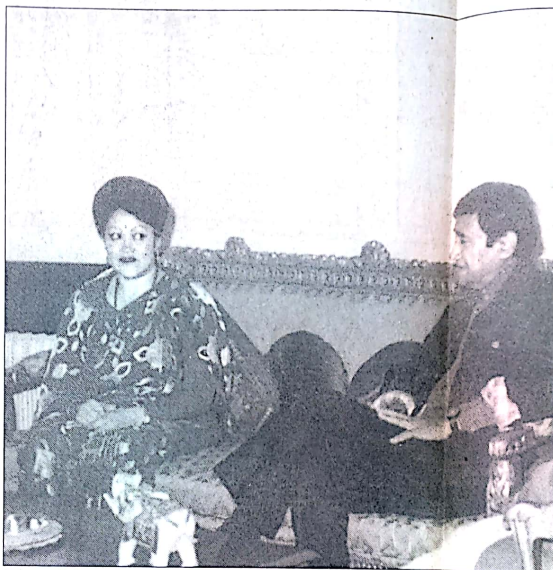
Representatives of cultural camaraderie: Dev Anand meets Queen Aishwarya (left); Shah Rukh

Inside, Dev held the audiences spellbound with his half-hour-long talk which was spiced with his experiences of the hill state, tales about the part King Birendra played in easing the way of Dev Anand's shootings in Nepal, the guitar-toting hippie girl who inspired the creation of a role for Zeenat Aman in Hare Rama Hare Krishna , and of course some personal advice on how to lead a dynamic life and remain young like himself.